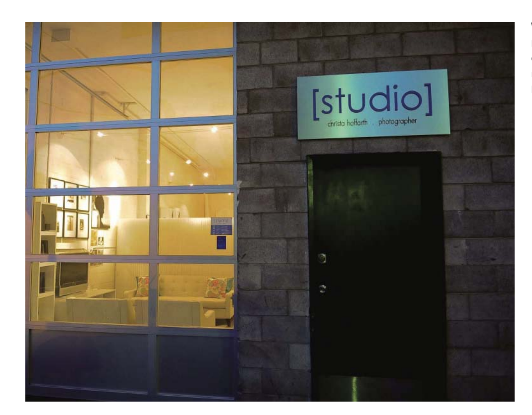
What do you offer that makes a prospective client want to open your door instead of heading down the road to the next studio?